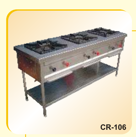
Three Burner Indian Range