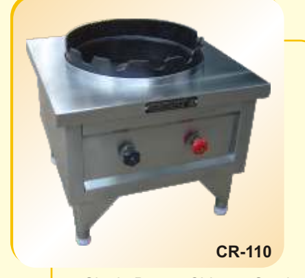
Single Burner Chinese Stock