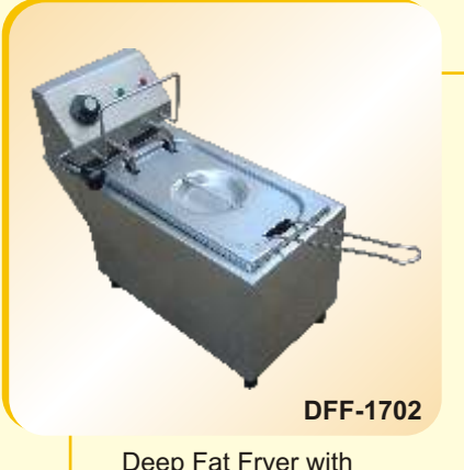
Deep Fat Fryer with Single Basket-Table Model