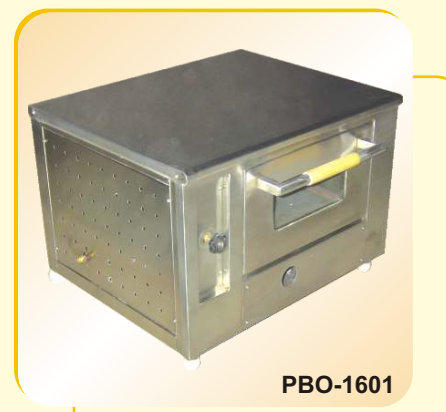
Pizza Oven-Gas/Electric Table Model