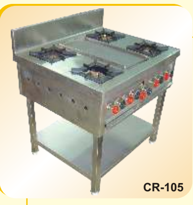
Four Burner Range with Dosa Plate