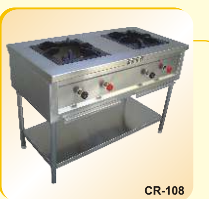
Two Burner Indian Range