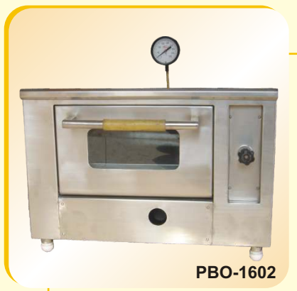
Pizza Oven-Gas/Electric Table Model