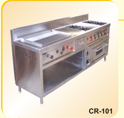
Multipurpose Cooking Range