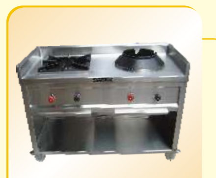
Two Burner Indian+Chinese Range Counter