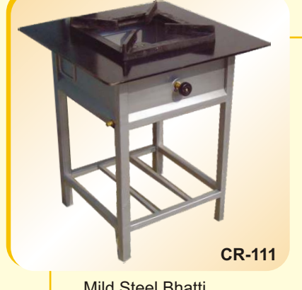
Mild Steel Bhatti