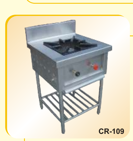
Single Burner Range with Piped Shelf