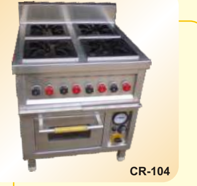
Four Burner Range with Oven