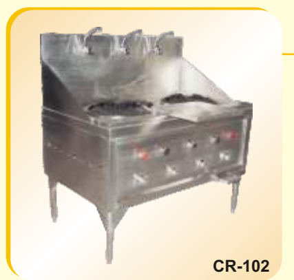
Continental Chinese Cooking