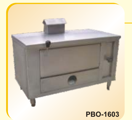
Pizza Oven-Gas-Table Model