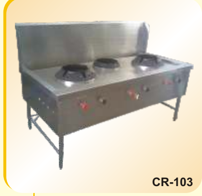
Continental Chinese Cooking