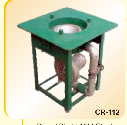
Diesel Bhatti-Mild Steel